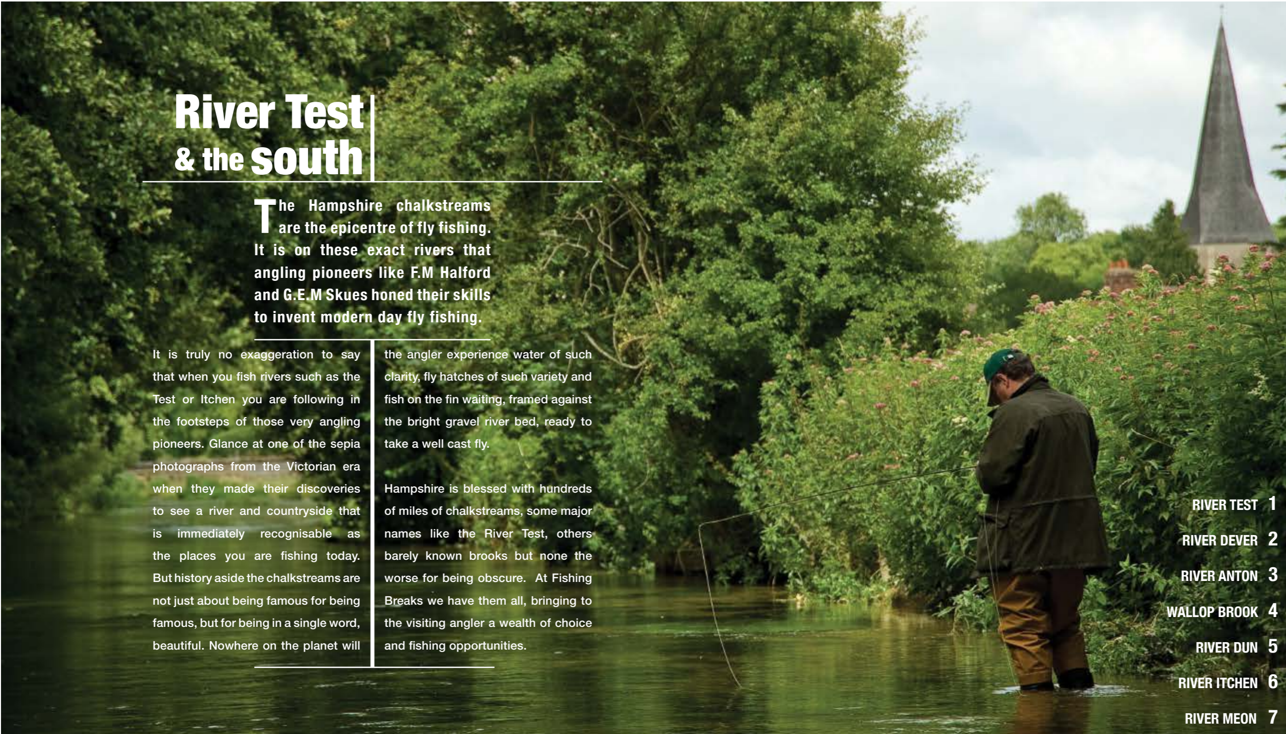
RIVER TEST, WHITCHURCH FULLING MILL, HAMPSHIRE

Hampshire is blessed with hundreds of miles of chalkstreams, some major names like the River Test, others barely known brooks but none the worse for being obscure. At Fishing Breaks we have them all, bringing to the visiting angler a wealth of choice and fishing opportunities.