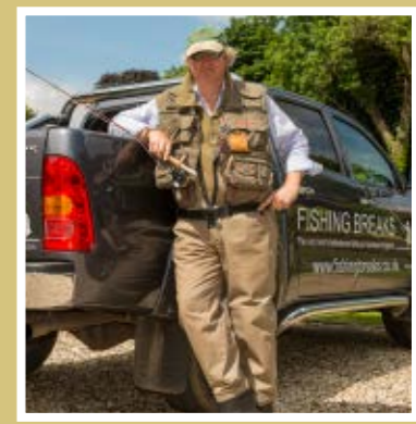
COVER: RIVER ITCHEN, HAMPSHIRE

FISHING BREAKS, THE MILL, HEATHMAN STREET NETHER WALLOP, STOCKBRIDGE, HAMPSHIRE SO20 8EW TEL. 01264 781988 info@fishingbreaks.co.uk www.fishingbreaks.co.uk